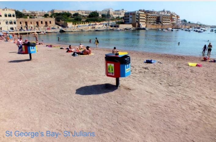
St George's Bay- St Julians

In 2016, MTA will take Blue Flag a step further for another Blue Flag beach. Beach management at Golden Bay has repeatedly met 100% of the Blue Flag criteria and its sand dunes and the surrounding environment are on the pathway to recovery. Therefore, it is now time for Golden Bay to achieve such status.