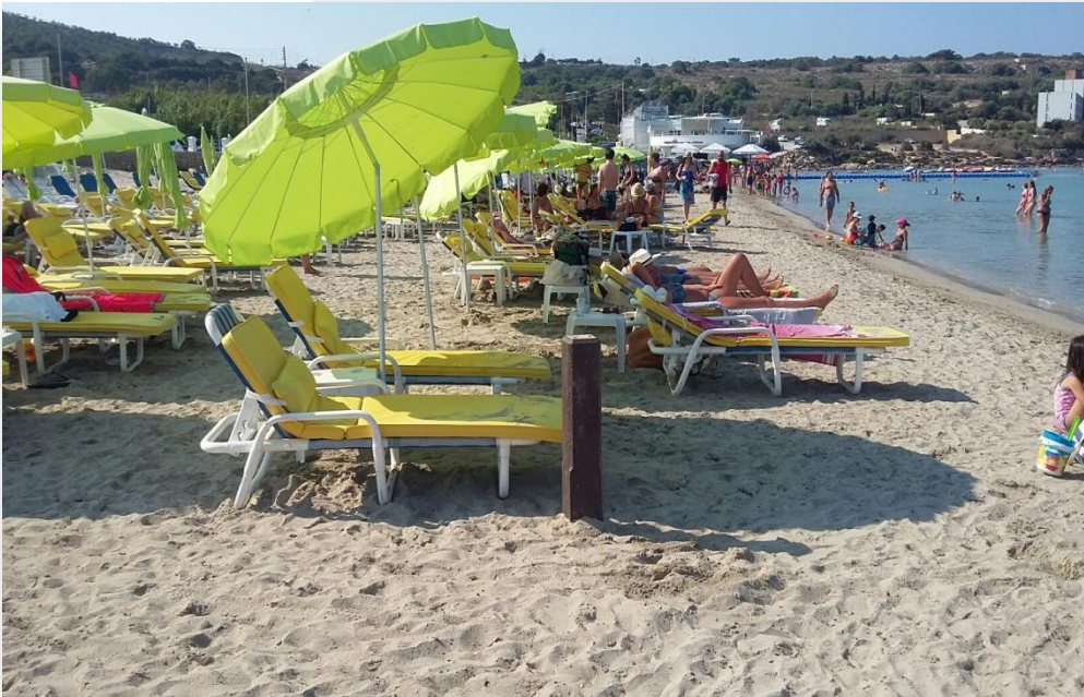
Għadira Bay Mellieha