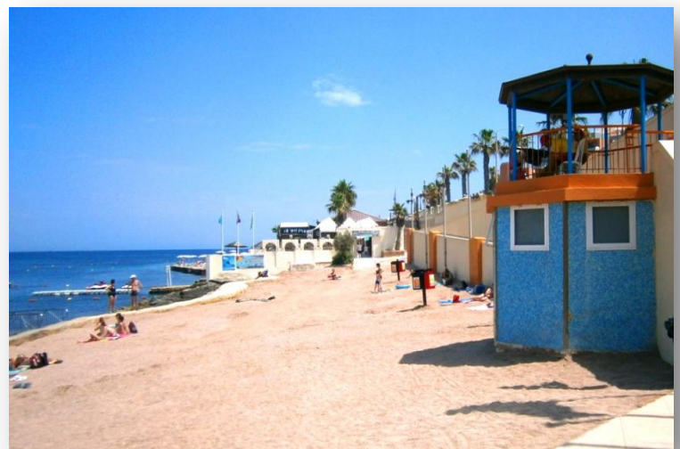
Buġibba Perched Beach