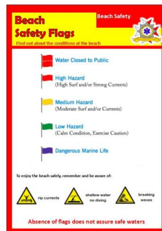
Marsalforn Bay Gozo