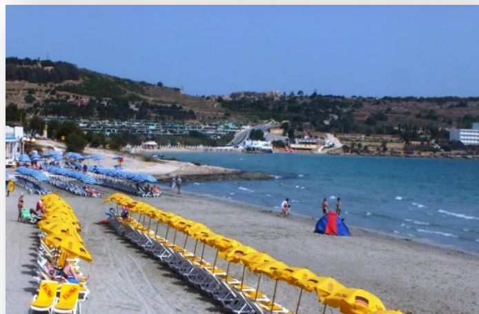
Għadira Bay - Mellieħa