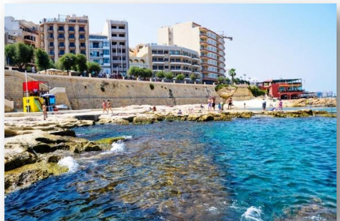
Fond Ghadir Sliema