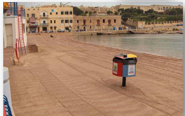
St George's Bay- St Julians