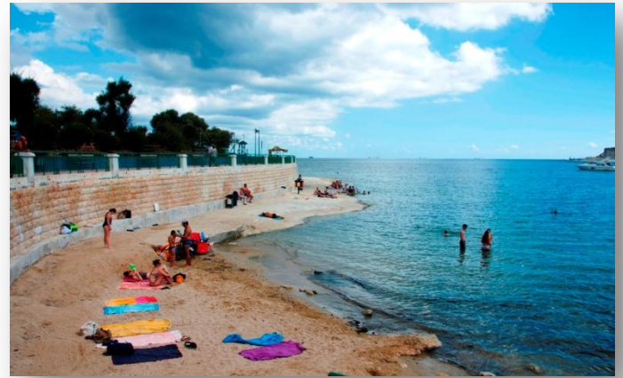
Ta' Fajtata - Marsascala

Marsascala rocky beach was furnished with a lifeguard tower, new picnic tables, open air Gymnasium, kids play area and other recreational spaces. Toilets, showers, railings and walkways have been upgraded by MTA and the beach is accessible with ramps that lead to the rocky shore.