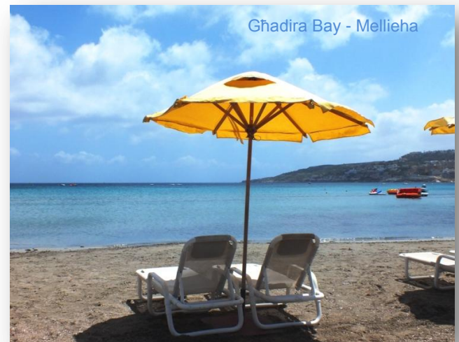
Ghadira Bay - Mellieħa

The positive results that were obtained year after year encouraged private entities to work for similar achievements. Paradise Bay Resort Hotel and Westin Dragonara Hotel received the quality awards of Blue Flag as well. This beach status encouraged also the Ministry for Gozo, who is working hard to obtain an award for Hondoq ir-Rummien Bay and Marsalforn Bay. The Ministry is also experimenting in beach management on Santa Maria and Blue Lagoon beaches on Comino. Two beaches, Għajn Tuffieħa Bay in Mgarr Malta and Ir-Ramla l-Hamra Gozo, managed by Gaia Foundation, also received the Blue Flag Award. A total of sixteen beaches were managed on the Islands in summer 2015.