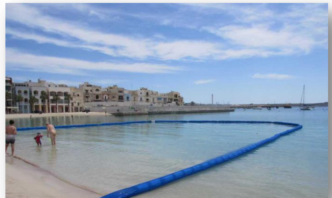
Pretty Bay- Birzebbuga