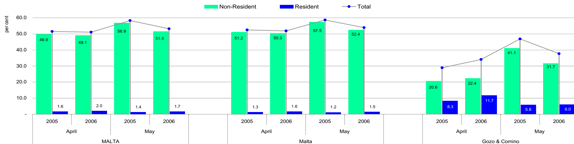
Chart 2. Net use of bed-places in collective accommodation establishments by residents and non-residents, at regional level*